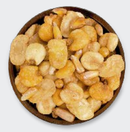
SEEDS Giant Corn, Chulpi Corn, Native Corn & Fava Beans (Broad Beans).